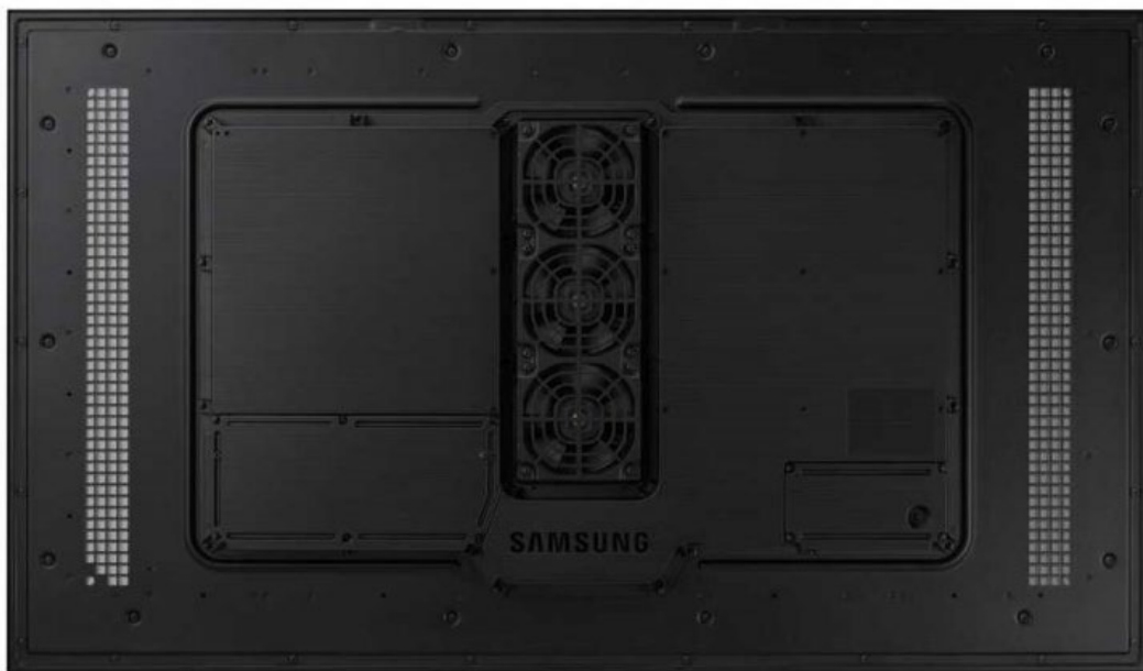
BACK (WITHOUT WALL MOUNT)