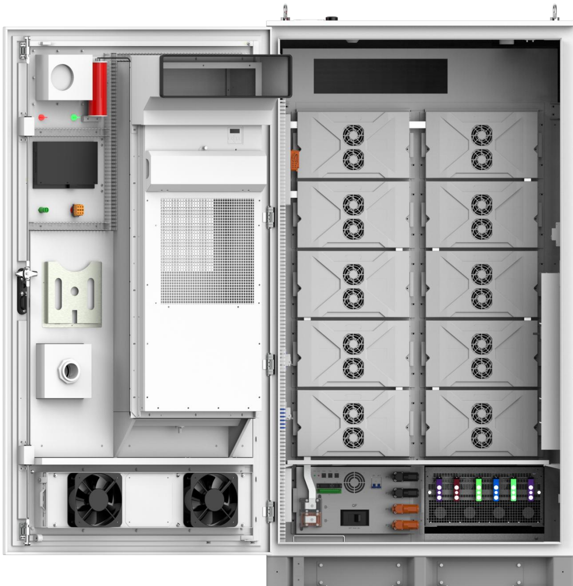
Figure 2.1.1 Product Rendering Diagram

This product adopts the integrated cabinet design, composed of PACK, PCS, fire protection, air conditioning and other components. The nominal capacity of this energy storage integrated cabinet is 125kW/200kWh. The battery connection mode of a single PACK is 1P20S, 10 packs are connected in series, and 314Ah lithium iron phosphate battery is used. A PACK capacity of 20kWh, PCS total fixed power of 125kW, the whole machine can support parallel expansion.