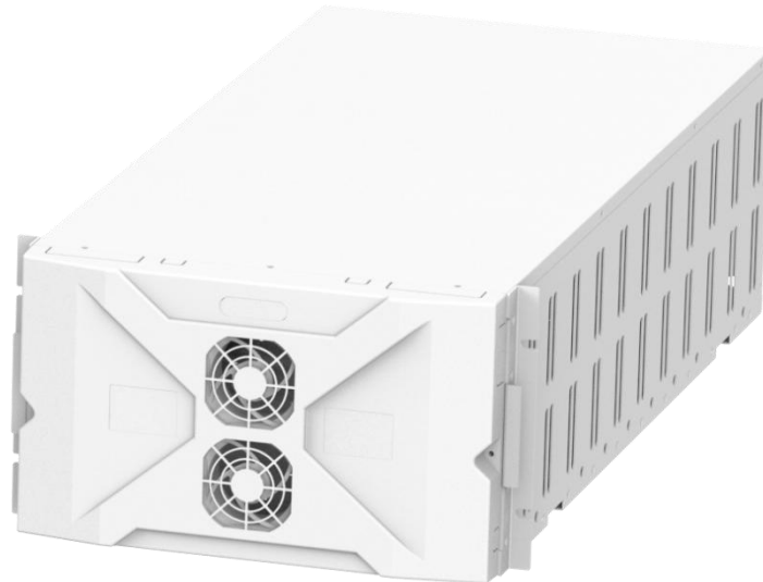
Figure 3.2.1 Battery PACK Schematic Diagram