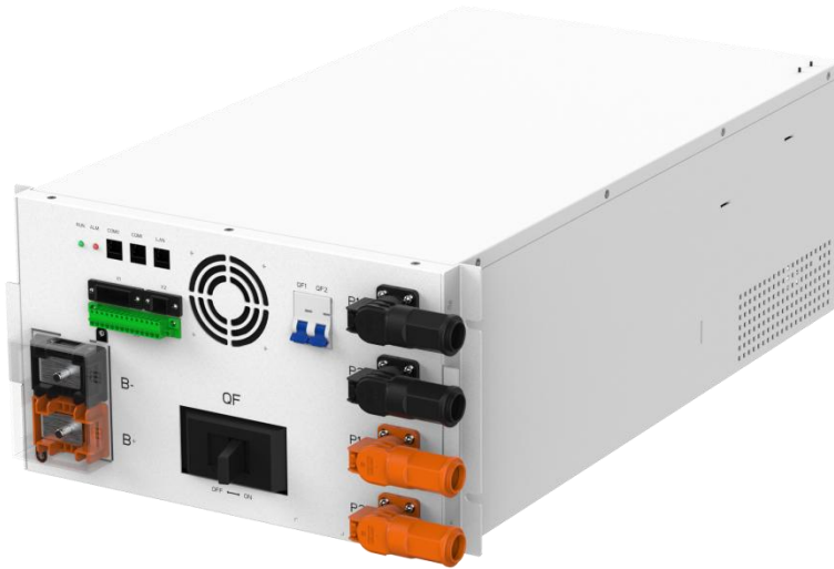
Figure 3.5.1 Schematic Diagram of Control Box