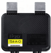
TS4 Flex MLPE

With Tigo EI Residential Solution you can increase the value of your home with a complete smart ecosystem that allows you to maximize the production of PV solar energy, store it in batteries and manage it as you see fit to increase your share of self-consumption and immediately reduce your electricity bill. All from the comfort of your smartphone display.