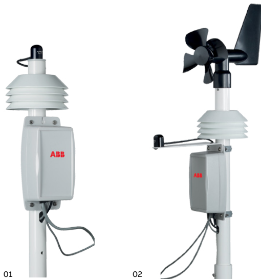
ABB monitoring and communications VSN800 Weather Station

The VSN800 Weather Station automatically monitors site meteorological conditions and photovoltaic panel temperature in real-time, transmitting sensor measurements to the Aurora Vision® Plant Management Platform.